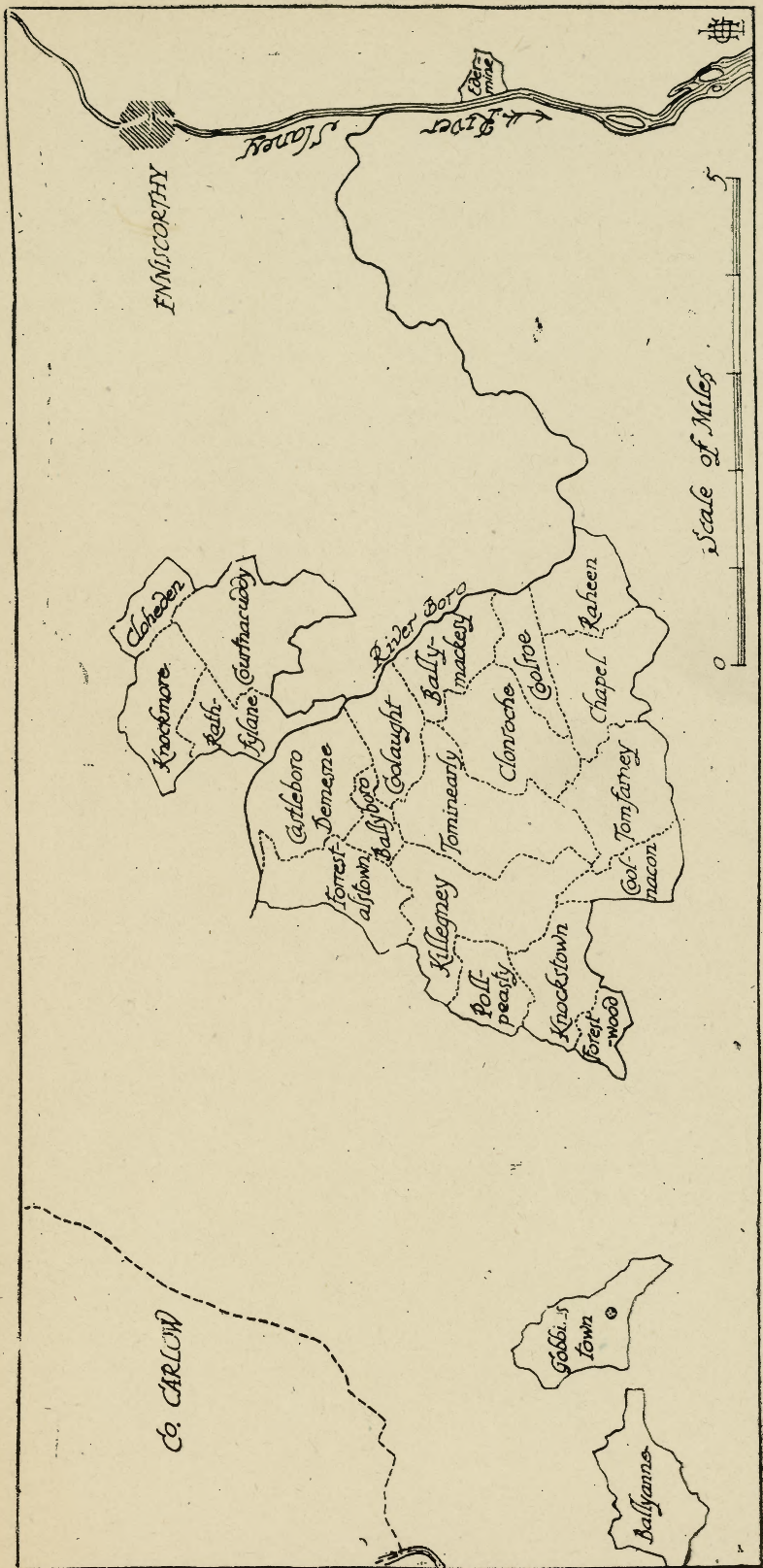
(2) Map showing details of positions of townlands near Castleboro demesne that contained holdings frequently referred to in the text.